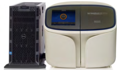
Ion GeneStudio S5 Prime System