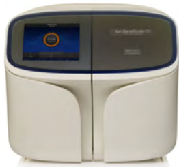
Ion GeneStudio S5 System