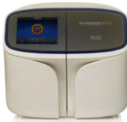
Ion GeneStudio S5 Plus System