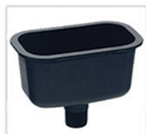
PP Sink resistant to acid, alkali and anti-corrosion