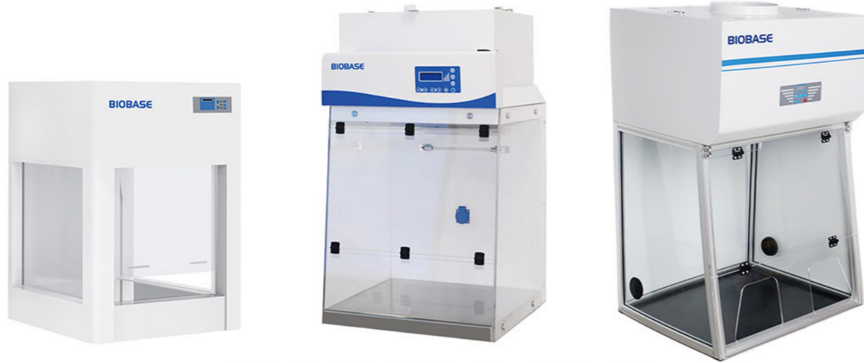
BBS-V500 & BYKG-VII