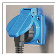
Waterproof Socket 2 waterproof sockets are located in the side panel, for optimum convenience of using small devices inside the cabinet.