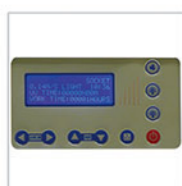
LCD Display Airflow velocity, UV timer, UV work time, system work time, real time.