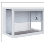
Side Glass Window The transparent side glass windows maximize light and visibility inside the cabinet, providing a bright and open working environment.