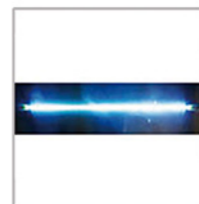
UV Lamp Emission of 253.7 nanometers for most efficient decontamination.