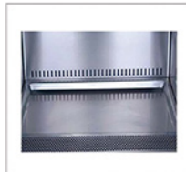
Work Zone Work zone, made of 304 stainless steel, is surrounded by negative pressure.