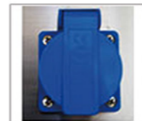
European Standard Socket