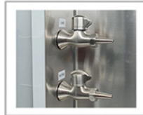
SS Water tap & Gas tap