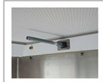
Wind Speed Sensor