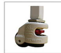
Footmaster Caster Universal caster with brake and leveling feet.