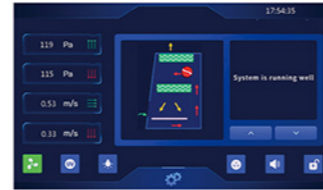
Color Touch Screen Touch operation, real-time and clearer display of various values and appointment timing function.