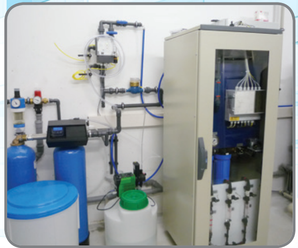
Customized Thermo Scientific central RO EDI pure water solution. All systems are manufactured in an ISO 9001/14001 TÜV certified facility.