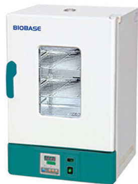
BOV-V30F/ BOV-V45F/ BOV-V65F/ BOV-V125F