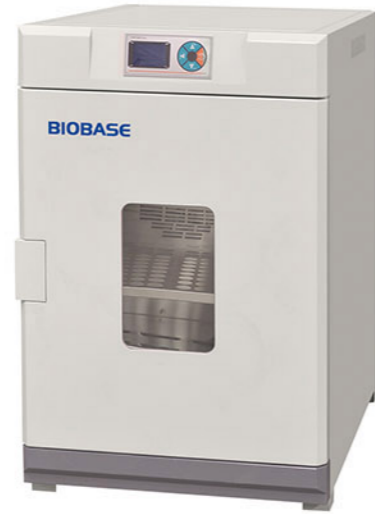
BOV-V70F/BOV-V136F/BOV-V225F/ BOV-V429F/BOV-V640F/BOV-V960F (Optional RS-485 interface for this series)