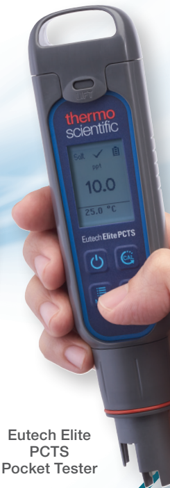
Eutech Elite PCTS Pocket Tester