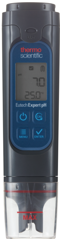
Eutech Expert pH Pocket Tester