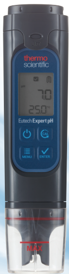
Eutech Expert pH Pocket Tester