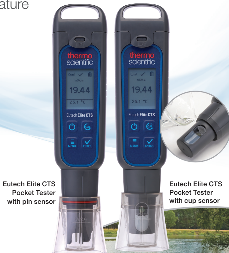
Eutech Elite CTS Pocket Tester with pin sensor