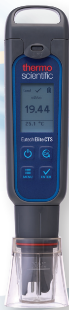
Eutech Elite CTS Pocket Tester (Pin)