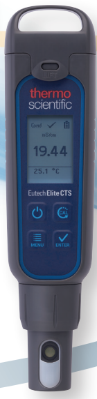
Eutech Elite CTS Pocket Tester (Cup)