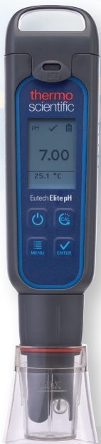
Eutech Elite pH Pocket Tester