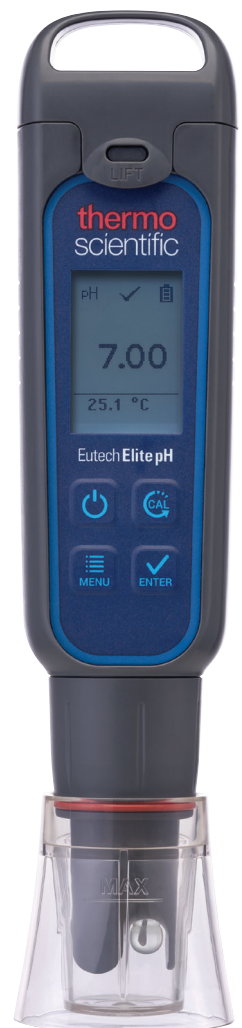
Eutech Elite pH Pocket Tester

Storage Wide, stable base allows the tester to stand independently