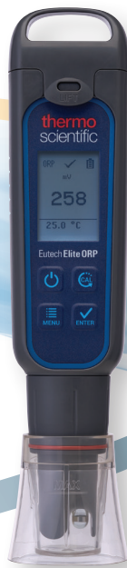
Eutech Elite ORP Pocket Tester