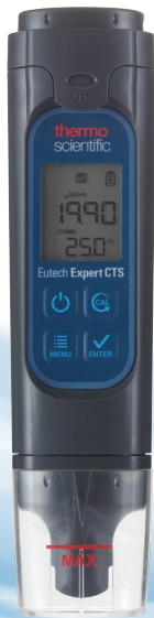
Eutech Expert CTS Pocket Tester (Pin)