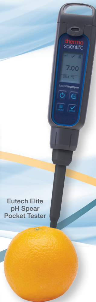
Eutech Elite pH Spear Pocket Tester