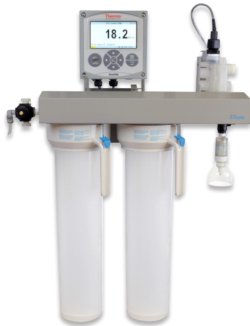
The Barnstead B-Pure Water System with Orion AquaPro Digital Meter with digital temperature compensation. Purity is displayed as resistivity or conductivity as well as temperature