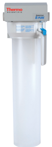
Barnstead B-Pure Water System with Single Holder and Filter