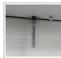
Wind Speed Sensor Direct measurement of wind speed