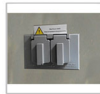
Waterproof Socket America Standard