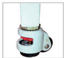
Footmaster Caster Universal caster with brake and leveling feet