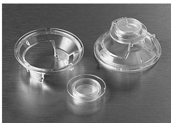
Polyester Snapwell inserts