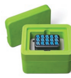
Corning CoolRack with Corning CoolBox

For more specific information on claims, visit the Certificates page at www.corning.com/lifesciences .