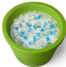
Corning Ice Bucket