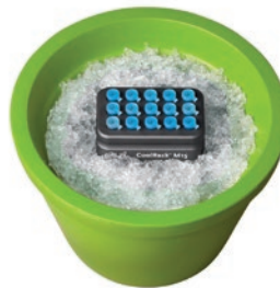
Corning CoolRack with Ice Bucket