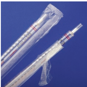
Clear plastic wrap