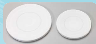
Non-slip Silicone Plate Covers