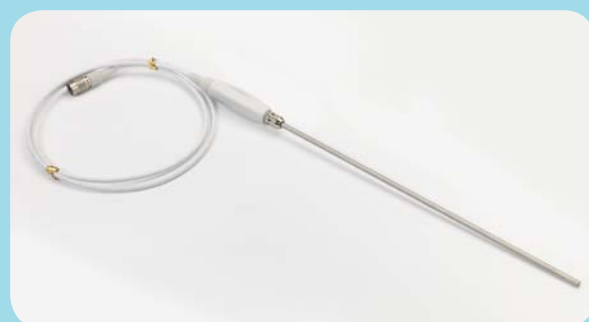
Includes Temperature Probe (PT 100, SN-8-4 connector sensor)