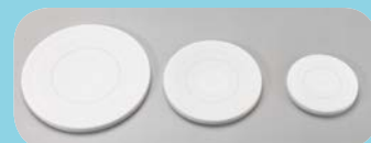
Non-slip Silicone Plate Covers