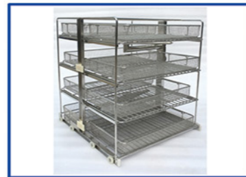
Standard cleaning rack