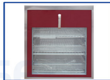
Toughened glass door