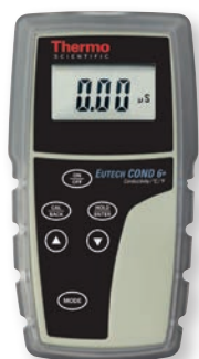
COND 6+ handheld conductivity meter