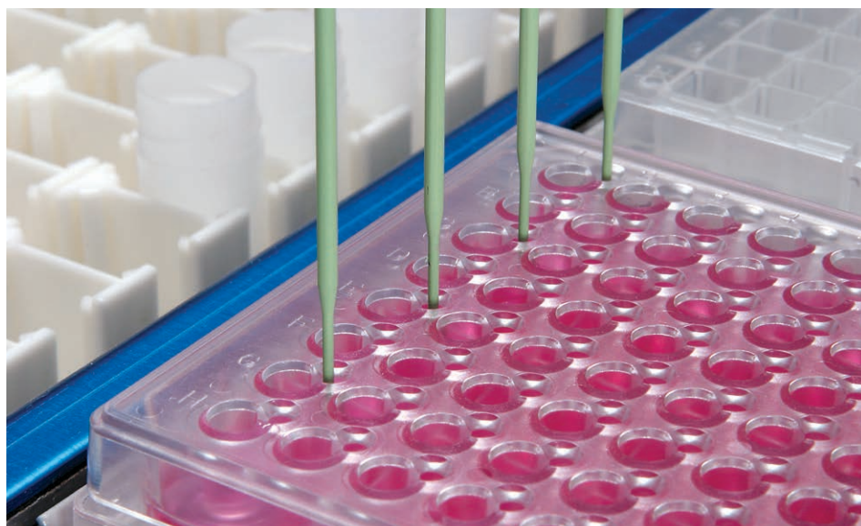
Media exchange through access ports using TECAN Genesis® RSP 150 liquid handler.

Permeability measured in Caco-2 cell monolayers cultured for 21-days in the Falcon Feeder Tray or Falcon 96-Square Well, Angled-Bottom Plate. While the newly designed Feeder Tray with drop-in baffle facilitates medium renewal, comparable results can be obtained in either format. Culturing cells in the Falcon Feeder Tray enhances consistency in well-to-well monolayer growth (TEER values) and function (P app values).