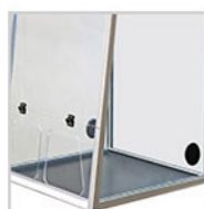
Three Side Glass Windows Back&Side glass windows maximize light and visibility, providing a bright and open working environment