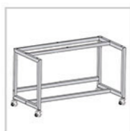
Base Stand Optional