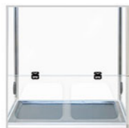
Folding acrylic front window, down part with free stop function