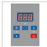
LED Display Digital LED display: Airflow Level