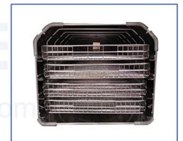
Type C(Optional for 45/80L)