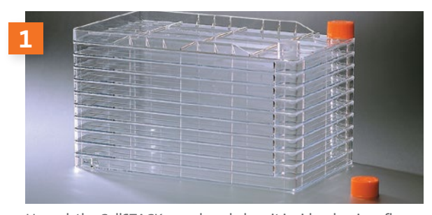
Unpack the CellSTACK vessel, and place it inside a laminar flow hood or clean room environment to carry out aseptic connections.

The following protocol requires a Corning<sup>®</sup> CellSTACK<sup>®</sup> filling cap (Cat. Nos. 3282, 3283, 11902, or 3333) and may require an air venting filter (Cat. No. 3281).