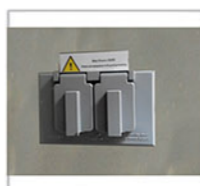
Waterproof Socket America Standard