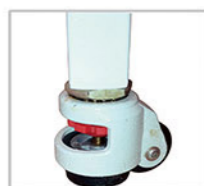
Footmaster Caster Universal caster with brake and leveling feet