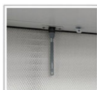
Wind Speed Sensor Direct measurement of wind speed