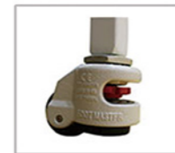
Footmaster Caster Universal caster with brake and leveling feet.