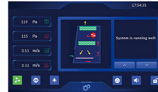
Color Touch Screen Touch operation, real-time and clearer display of various values and appointment timing function.