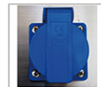
European Standard Socket