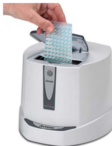
Proper loading of a PCR Plate