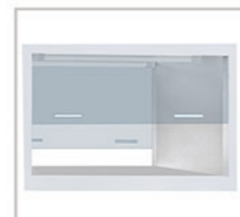
Double Sides Double sides work bench, operators can sit face to face