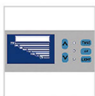
LED Display Microprocessor control system, LED display