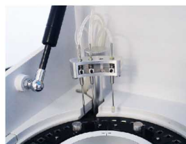
Washing Probe Independent 2-step washing system.