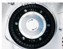
Reaction Tray 37±0.1°C, real-time monitor.