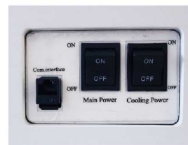
LAN Port Access