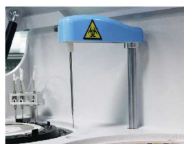
Sample Needle Liquid level sensor function. Anti-collision function. Reagent volume real-time detection.