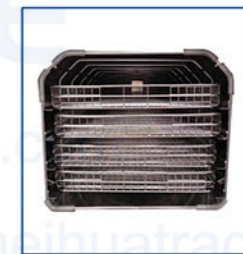
Type C (Optional for 45/60/80L)