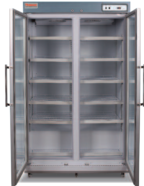
Shown left to right: Lab refrigerators PLR221, PLR386, PLR1006; Lab freezer PLF276