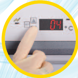
Digital temperature controller with intuitive interface