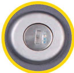
Door locks and additional space for padlocks on all models