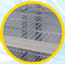
Configurable and adjustable shelving in lab refrigerators; continuous shelving on double-door models (no obstructions)