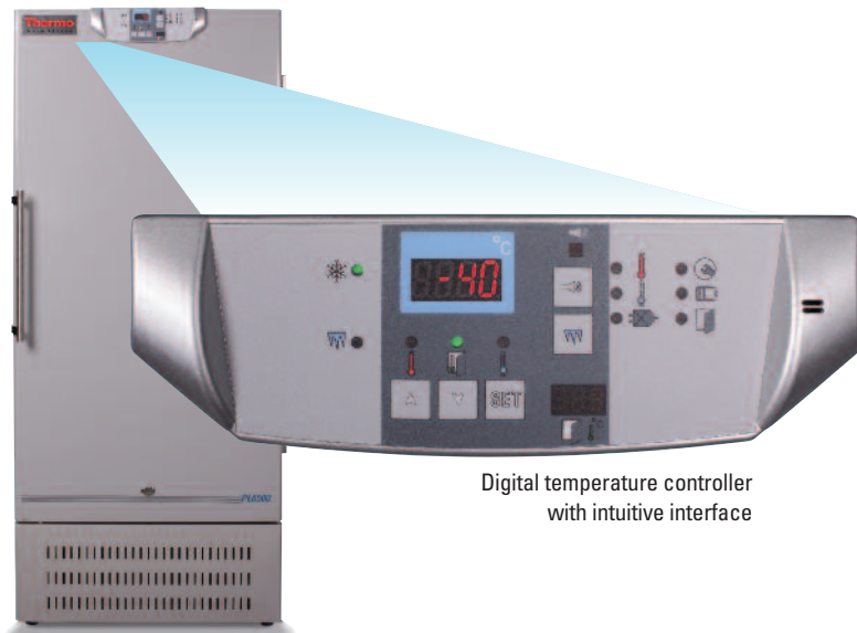
Digital temperature controller with intuitive interface