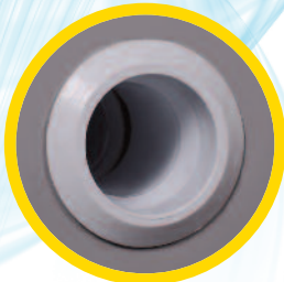
Standard 25mm access port on all models