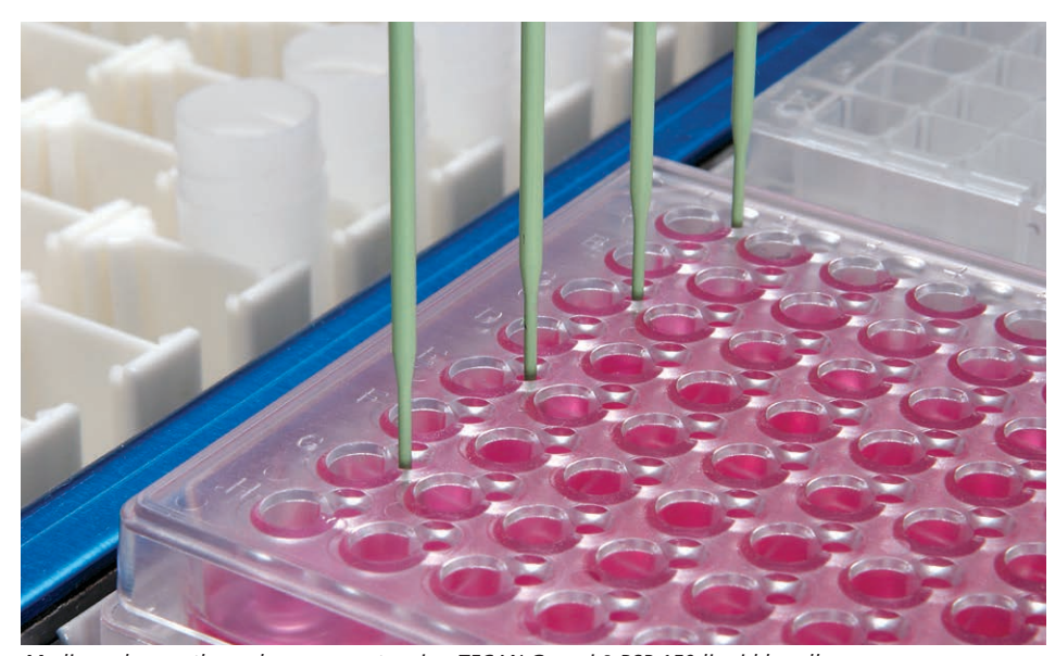
Media exchange through access ports using TECAN Genesis® RSP 150 liquid handler.

Permeability measured in Caco-2 cell monolayers cultured for 21-days in the Falcon Feeder Tray or Falcon 96-Square Well, Angled-Bottom Plate. While the newly designed Feeder Tray with drop-in baffle facilitates medium renewal, comparable results can be obtained in either format. Culturing cells in the Falcon Feeder Tray enhances consistency in well-to-well monolayer growth (TEER values) and function (Papp values).