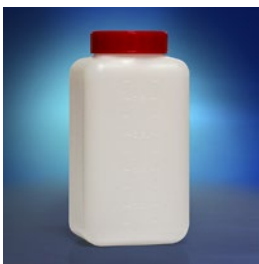
Square bottle 1L HDPE