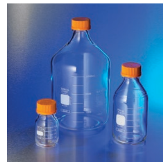
PYREX round glass storage bottles