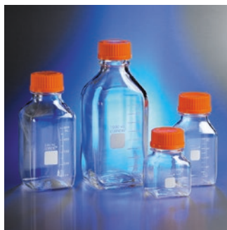
Corning square PC storage bottles