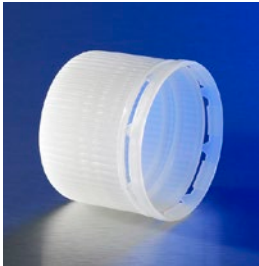
Tamper-evident screw cap