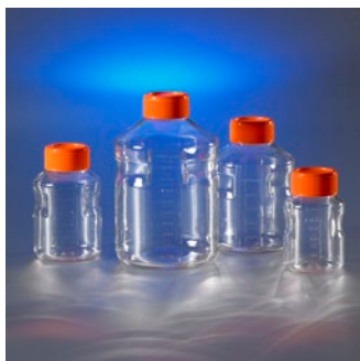
Corning easy grip round PS storage bottles