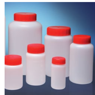
Corning Gosselin round HDPE storage bottles