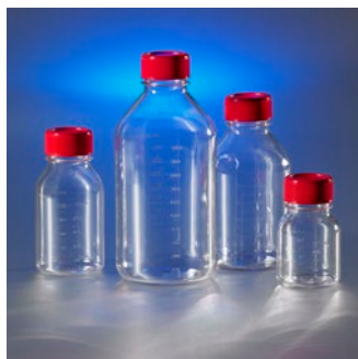
Costar round PS storage bottles