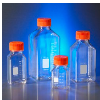
Corning square PET storage bottles

*Bottle performance in freezers depends on both the temperature and contents in the bottle. It is strongly recommended that a trial run be performed under actual conditions to test the suitability of the bottles for frozen storage.