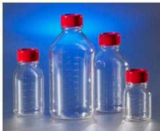
Costar traditional style storage bottles