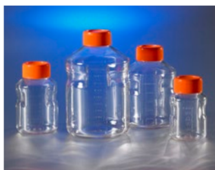
Corning low profile easy grip style storage bottles