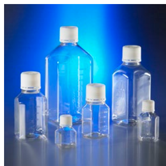
Corning octagonal PET storage bottles