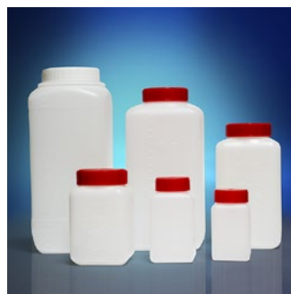
Corning Gosselin square HDPE storage bottles