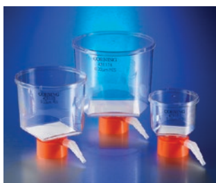
Bottle top vacuum filters