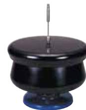
Figure 2. The Thermo Scientific TCF-32 continuous flow rotor.