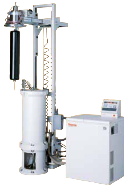
Figure 1. The Thermo Scientific Sorvall CC 40 continuous flow ultracentrifuge system.

The Thermo Scientific™ Sorvall™ CC 40 continuous flow ultracentrifuge system can purify and harvest research, pilot and production volumes of culture fluid. The Thermo Scientific TCF-32 rotor system, used for research or pilot production, can process up to 15 L, and the Sorvall CC 40 can process production volumes up to 100 L.