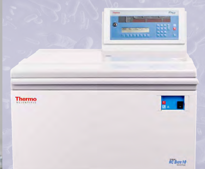
Thermo Scientific Sorvall RC BIOS Centrifuge Systems