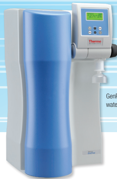
GenPure standard water system