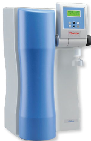
◀ GenPure standard system features controlled dispensing.