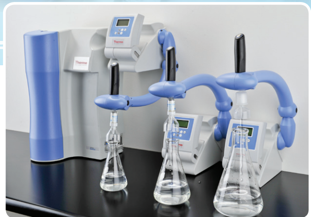
▲ For increased flexibility, add up to two more xCAD Plus remote dispensers. Water can dispense simultaneously from all three dispensers.