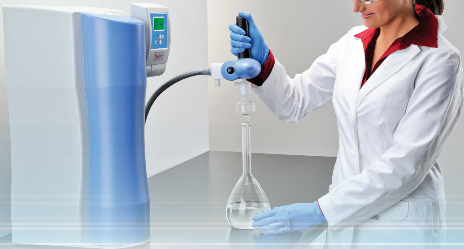
▲ The GenPure Pro system dispenser can reach up to 24 in (60 cm) from the unit.

Choose the ideal dispensing for your lab.