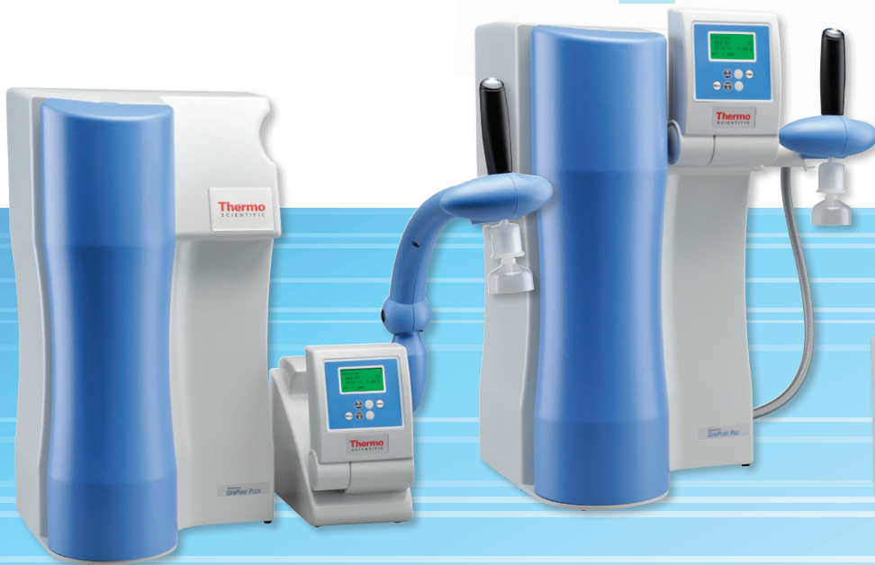
GenPure xCAD Plus water system