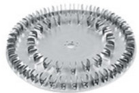
Cat. No.: 18900160 Type 1 plate 60*1.5ml centrifuge tube

Accessories for MX-RD-Pro: 18900160 plate or 18900162 plate can be selected as the standard accessory; 18900161 plate is optional.