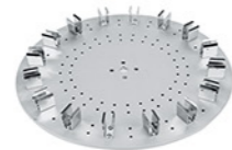
Cat. No.: 18900161(Optional) Type 2 plate 16*15ml centrifuge tube