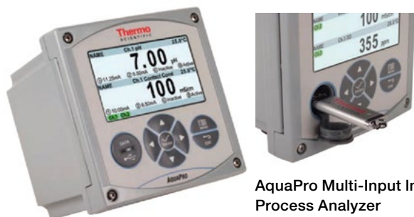
AquaPro Multi-Input Intelligent Process Analyzer