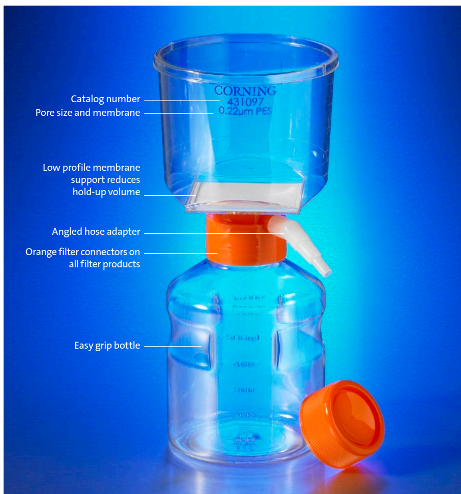
Corning® 500 mL filtration system consists of a 500 mL polystyrene receiver bottle and filter funnel (Cat. No. 431097)

*1L Filtration System Benchmark Average Liquid Retention (n = 6).