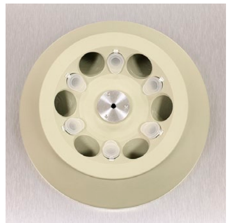
Combination Rotor for 5, 15, and 50 mL Tubes