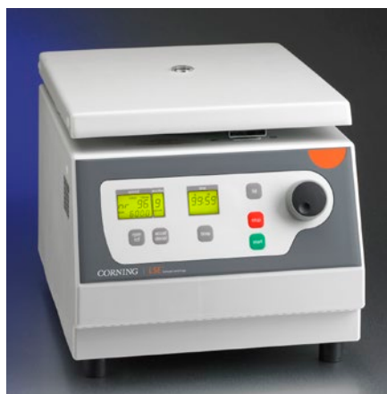
Corning LSE Compact Centrifuge