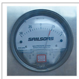
Pressure Meter Display the pressure of work zone.