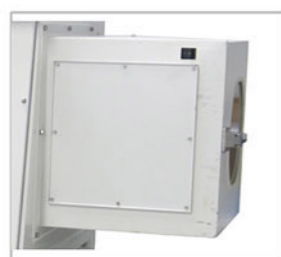
Pass Box Double doors with interlock function and UV lamp.

Website: www.biobase.cc / www.meihuatrade.com