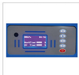
LCD Display Large display is easy to monitor the pressure parameters for work zone and three filters.