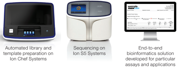
Figure 1. A complete workflow—from sample preparation to report.

The assay is compatible with both the Ion PGM™ and Ion S5™ Systems, and comes with either manual or automated library preparation configurations for the Ion Chef™ system (Figure 1). Sample preparation to analysis can be achieved in 2–3 days, depending on the sample type, and is powered by our integrated OncoPrint Knowledgebase reporting software (Figure 2), which links variants to relevant labels, guidelines, and global clinical trials.