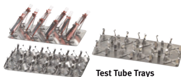
Test Tube Trays