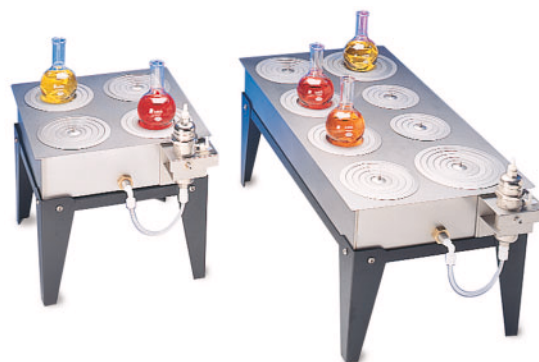
Precision Concentric Ring Electrical Steaming Baths

Precision Concentric Ring Electrical Steaming Baths are designed to gently warm samples, make concentrates, and melt solids such as agar. Available in both 4-opening and 8-opening models, they accommodate various sizes of glassware and evaporating dishes, including round-bottom flasks. Flange-formed stainless-steel rings nest smoothly and become progressively larger as each concentric ring is removed. Copper-clad immersion heaters provide bath temperatures up to 100 °C. These baths require hardwire installation by a qualified electrician and need to be hooked up to a continuous water source.