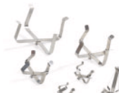
Test Tube Clips