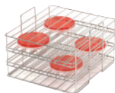
Petri Dish Rack