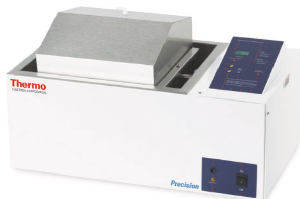
Precision Dubnoff Shaking Bath with large gassing hood

Precision's Dubnoff Reciprocal Shaking Baths are designed specifically for applications that require your samples to be incubated in a controlled atmosphere. This bath has a capacity of 14.5 liters (3.9 gallons), and has a depth of 3.5 inches (8.9 cm). One large and two small gassing hoods are included with each bath along with the gable cover. An optional 3-gas (oxygen, nitrogen, and CO 2 ) flowmeter is available for precise control of the atmosphere surrounding your important samples.