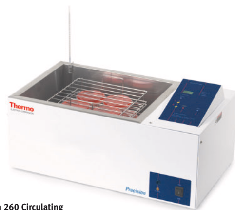
Precision 260 Circulating Water Bath with optional Petri dish rack