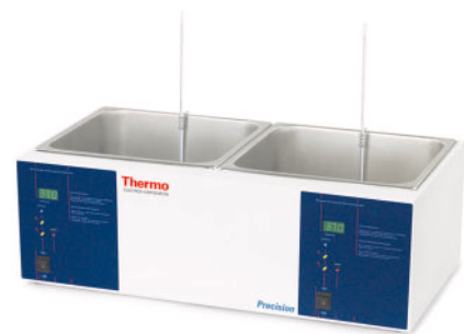
Precision 281 Digital Water Bath with optional thermometer