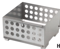
High Wall Tray