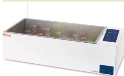
Precision 270 Circulating Water Bath

Precision Circulating Water Baths are ideal for applications where temperature uniformity and control are critical, such as enzymes and serology. Available in three different models, these high performance baths range in capacity from 19 liters to 89 liters and include a stainless steel diffuser shelf and a gable cover as standard equipment.