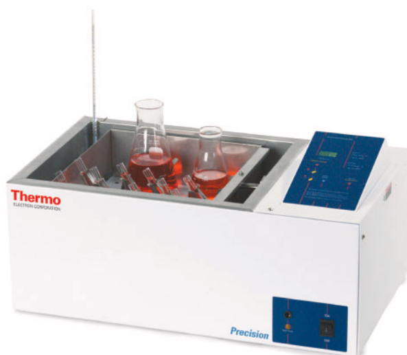
Precision Shallow Form Shaking Bath with optional thermometer

Precision's Shallow Form Reciprocal Shaking Baths have a capacity of 14.5 liters (3.9 gallons), however the removable tray provides a depth of only 3.5 inches (8.9 cm) for use with smaller sample containers. This bath can be equipped with optional 3-gas (oxygen, nitrogen, and CO 2 ) flowmeter and gassing hoods.