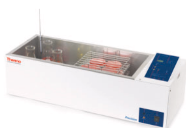
Precision 265 Circulating Water Bath with optional Petri dish rack