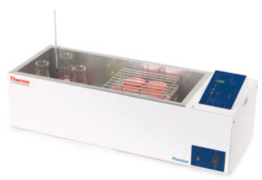
Precision 265 Circulating Water Bath with optional Petri dish rack