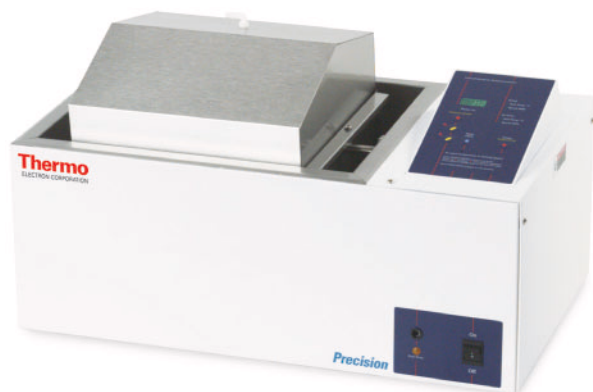
Precision Dubnoff Shaking Bath with large gassing hood

Precision's Dubnoff Reciprocal Shaking Baths are designed specifically for applications that require your samples to be incubated in a controlled atmosphere. This bath has a capacity of 14.5 liters (3.9 gallons), and has a depth of 3.5 inches (8.9 cm). One large and two small gassing hoods are included with each bath along with the gable cover. An optional 3-gas (oxygen, nitrogen, and CO<sub>2</sub>) flowmeter is available for precise control of the atmosphere surrounding your important samples.