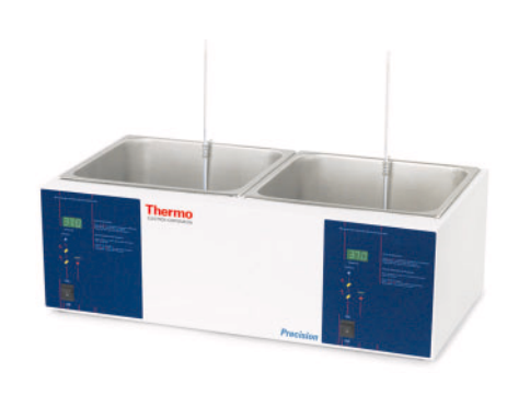
Precision 288 Digital Water Bath with optional thermometers