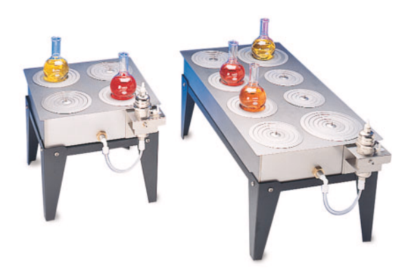
Precision Concentric Ring Electrical Steaming Baths

Precision Concentric Ring Electrical Steaming Baths are designed to gently warm samples, make concentrates, and melt solids such as agar. Available in both 4-opening and 8-opening models, they accommodate various sizes of glassware and evaporating dishes, including round-bottom flasks. Flange-formed stainless-steel rings nest smoothly and become progressively larger as each concentric ring is removed. Copper-clad immersion heaters provide bath temperatures up to 100 °C. These baths require hardwire installation by a qualified electrician and need to be hooked up to a continuous water source.