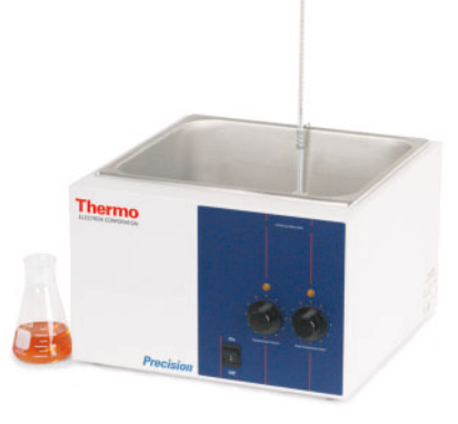
Precision 183 Analog Water Bath