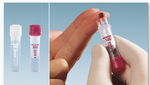
Microvette® 300/500 Blood collection with collection rim

More information is available on request.