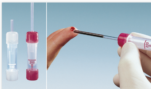
Microvette® 100/200 Blood collection with End-to-End capillary