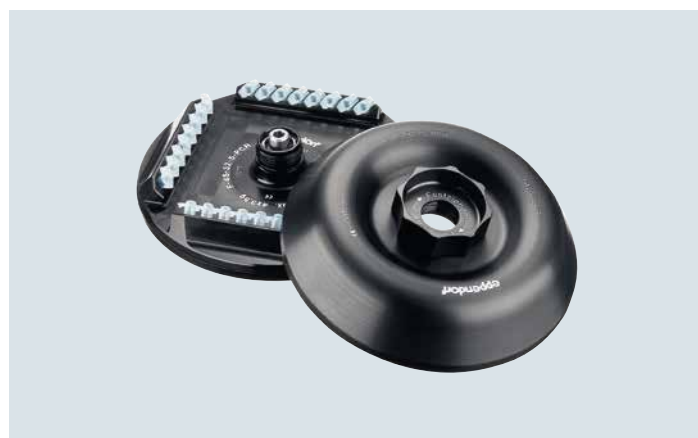
4 × PCR-strip rotor for centrifugation up to 18,615 × g /15,000 rpm (F-45-32-5-PCR; Order no. 5424 704.000).