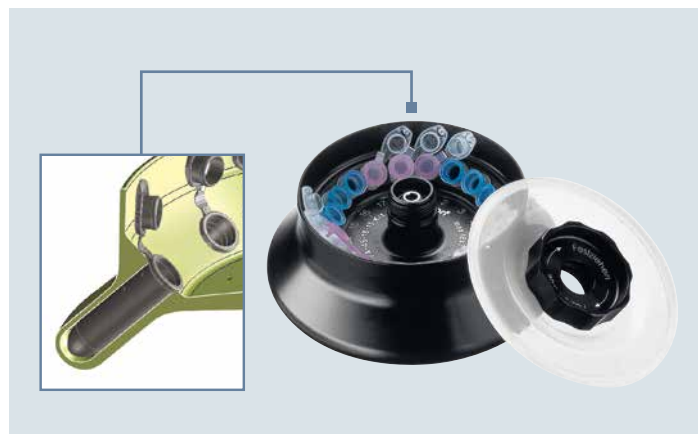
Eppendorf Kit rotor for 18 × spin columns and 1.5/2.0 mL tubes with speed up to 18,111 × g /15,000 rpm. This rotor is designed with an extended rim that protects tube caps from shearing off (FA-45-18-11-Kit; Order no. 5424 706.002).