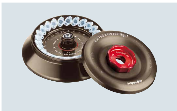
Aerosol-tight rotor for 24 × 1.5/2 mL tubes with PTFE-coating for high chemical resistance. Provides speed up to 21,130 × g /15,000 rpm (FA-45-24-11-Special; Order no. 5424 700.004).