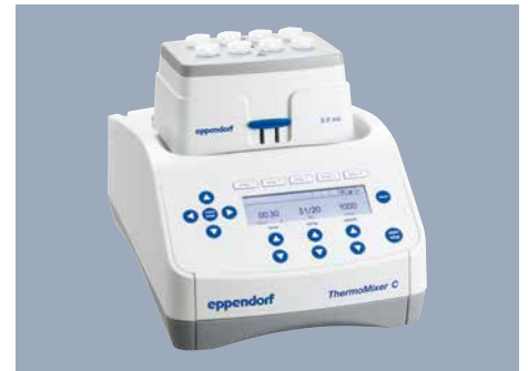
Optimized thermoblocks guarantee accurate temperature control and efficient mixing in Eppendorf ThermoMixer ® and MixMate ® .