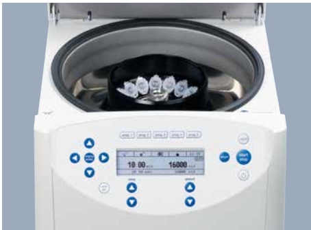
High-speed centrifuge rotors and high centrifugation resistance of our tubes allow you to get your results even quicker.

storing samples at -80^{\circ}\text{C} , or incubating them at up to 100^{\circ}\text{C} , the perfect combination of Eppendorf instruments, Eppendorf Tubes ® , plates and pipette tips will help you to excel your results and give you the best working experience possible.