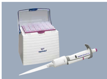
Broad range of pipettes from 0.1\ \mu\text{L} to 10\ \text{mL} . The complementary set of epT.I.P.S. ® allows for stress-free and contamination-free work.