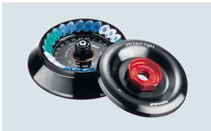
Aerosol-tight rotor for 24 × 1.5/2.0 mL tubes provides speed up to 21,130 × g /15,000 rpm. (FA-45-24-11; Order no. 5424 702.007).