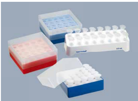
For sample preparation and storage, we offer the ideal racks and boxes for our Eppendorf Tubes.