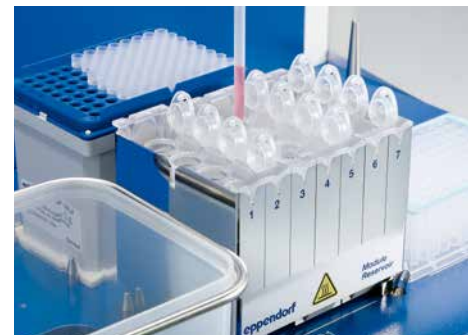
A broad range of adapters make for easy integration into our automated pipetting system epMotion ®