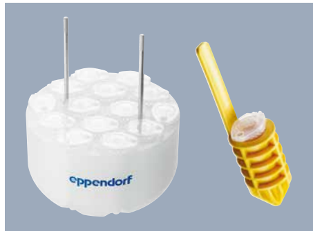
Adapters for most common swing-bucket and fixed-angle rotors make it easy to integrate the Eppendorf Tubes into existing centrifuges.