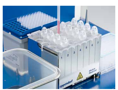
A broad range of adapters make for easy integration into our automated pipetting system epMotion®