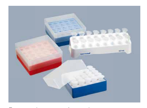
For sample preparation and storage, we offer the ideal racks and boxes for our Eppendorf Tubes.