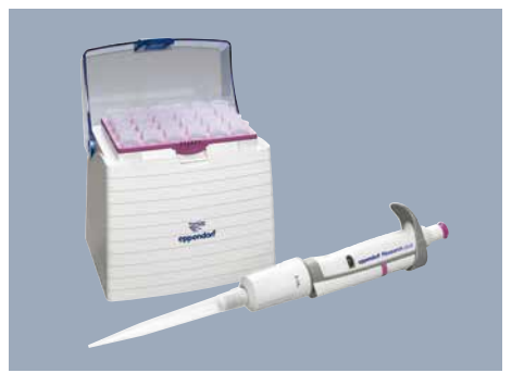
Broad range of pipettes from 0.1 \mu L to 10 mL. The complementary set of epT.I.P.S.® allows for stress-free and contamination-free work.