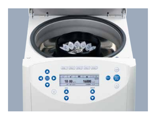
High-speed centrifuge rotors and high centrifugation resistance of our tubes allow you to get your results even quicker.

storing samples at -80°C, or incubating them at up to 100 °C, the perfect combination of Eppendorf instruments, Eppendorf Tubes®, plates and pipette tips will help you to excel your results and give you the best working experience possible.