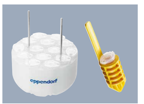
Adapters for most common swing-bucket and fixed-angle rotors make it easy to integrate the Eppendorf Tubes into existing centrifuges.