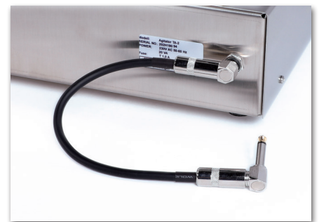
Motion detector connection (on the back)