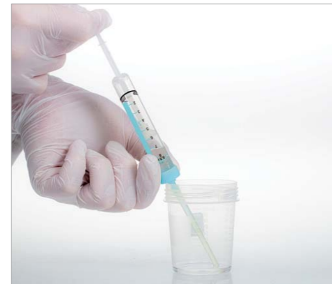
Safe collection of the saliva sample with the aspiration technique.