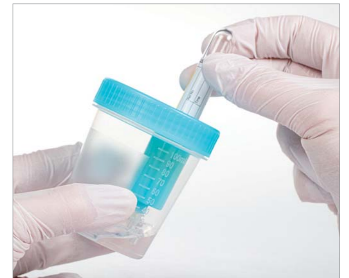
Sealed saliva transfer with the vacuum technique.