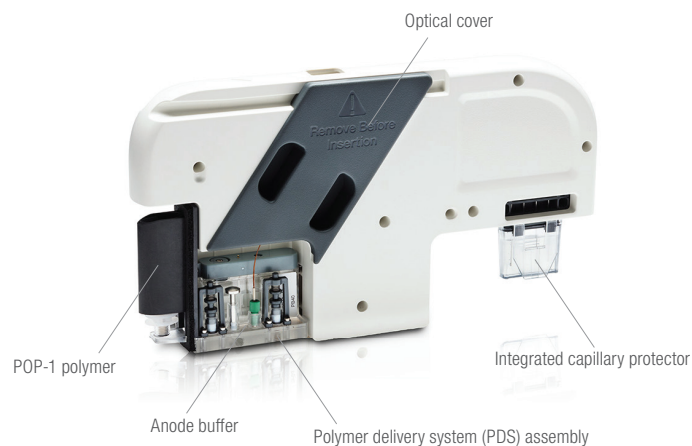
Figure 2. Integrated all-in-one cartridge design. The cartridge contains four capillaries, a detector, and a pump system that delivers polymer and buffers.